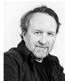
Michael A. Stackpole New York Times Bestselling Author